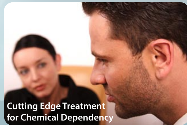
Cutting Edge Treatment for Chemical Dependency

Community Services Counseling 963 S Orchard Suite B Boise Idaho 83705